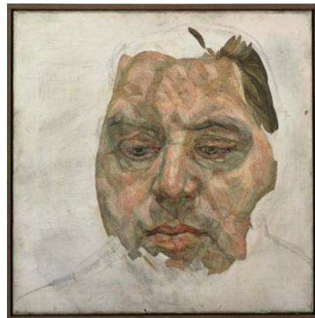
Lucian Freud - Sleeping Head - 1979-80 - oil on canvas, 40.32 x 50.48 cm. - Private Collection